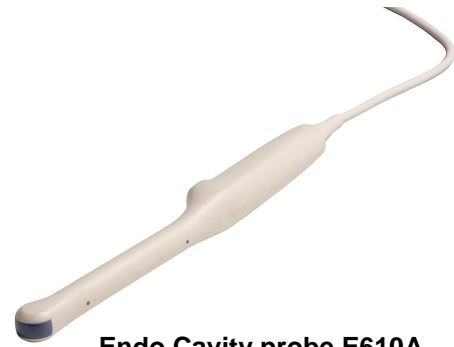
Endo Cavity probe E610A

Frequency : 6.5 MHz Number of elements : 128 Radius : 10 mm