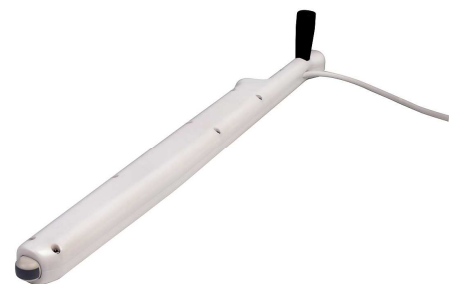
« Ready to use set » OVUM PICK UP GUIDE & PROBE